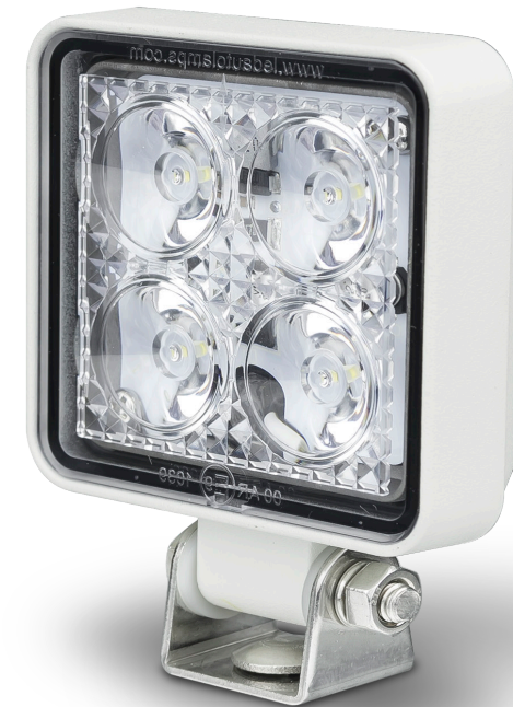
Reverse/Flood Lamp, White E-Coated 7312WM - Blister