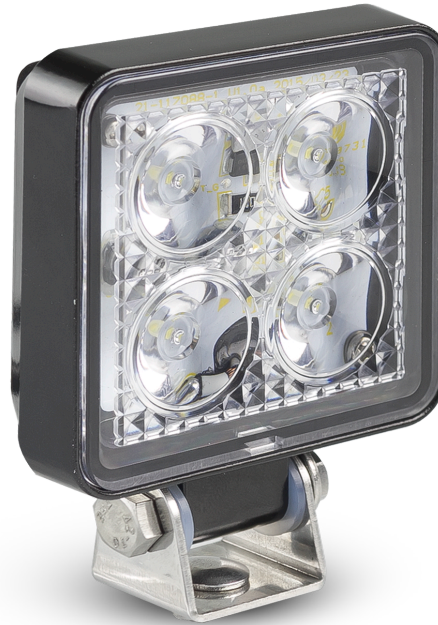
Reverse/Flood Lamp, Black E-Coated 7312BM - Blister